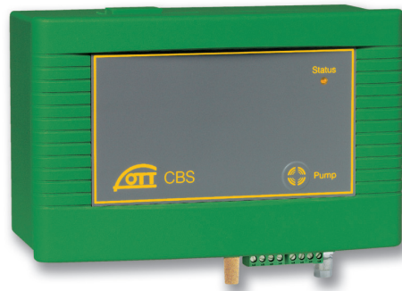
Water level measurement OTT CBS – compact bubble sensor for measuring depth and water level