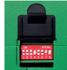
DIP switches for easy programming