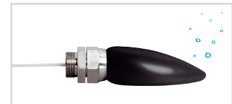
Accessory: OTT EPS 50 bubble chamber