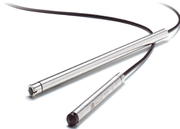
Water Level Measurement OTT Orpheus Mini – Pressure probe with integrated temperature sensor and data logger