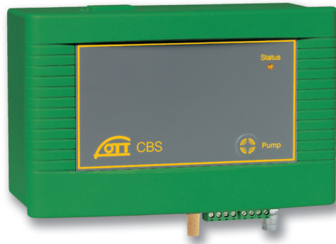
Water level measurement OTT CBS – compact bubble sensor for measuring depth and water level