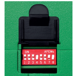
DIP switches for easy programming