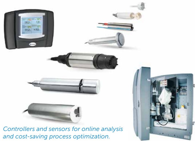
Controllers and sensors for online analysis and cost-saving process optimization.