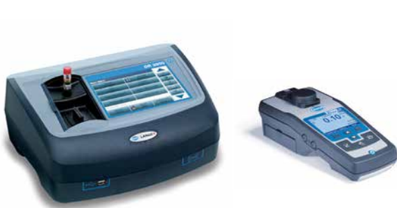
Benchtop and portable instruments for lab analysis. Inspection, maintenance and equipment qualification services available.

* For additional parameters and solutions please contact your local Hach representative or visit our website.