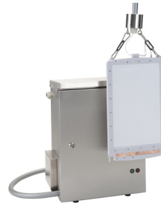
Figure 7: Filtrax (eco) Sample Filtration System

The analysis report below shows the Claros RTC-C/N/P software's impact of improved dosing. Note the reduction in undesirable COD and TN peaks in the outlet.