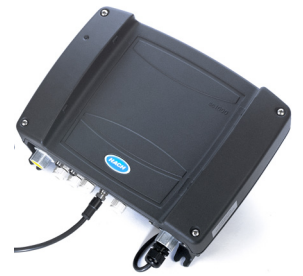
Figure 6: SC1000 Controller Probe Module