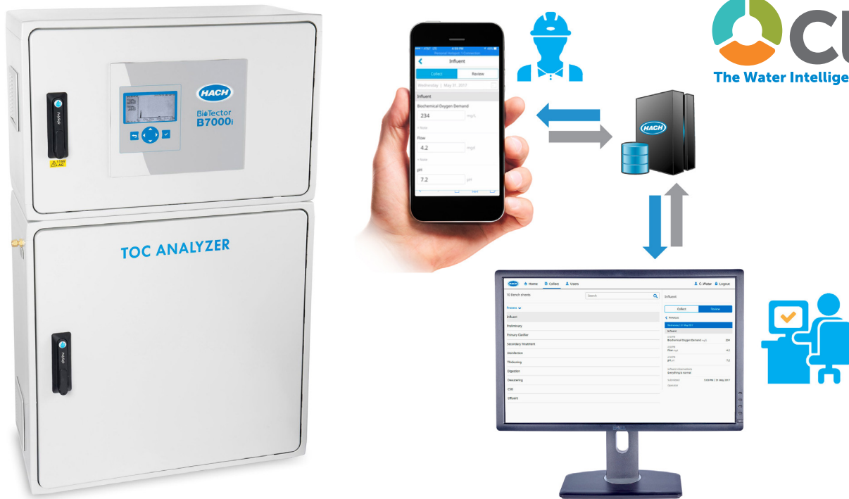
Figure 3: The Hach BioTector B7000i TOC Analyzer pairs with Claros RTC-C/N/P software for feed-forward nutrient dosing control.