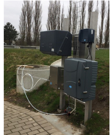
Figure 2: Hach Amtax sc Ammonium Analyzer, Nitratax sc Nitrate Sensor, and SC1000 Controller Probe Module.

This manual dosing issue was the situation for Harboes Bryggeri A/S, which was looking for a solution to reduce manual laboratory analysis, automate N dosing, and improve outlet compliance.