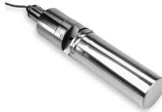
Figure 5: Nitratex sc Nitrate Sensor