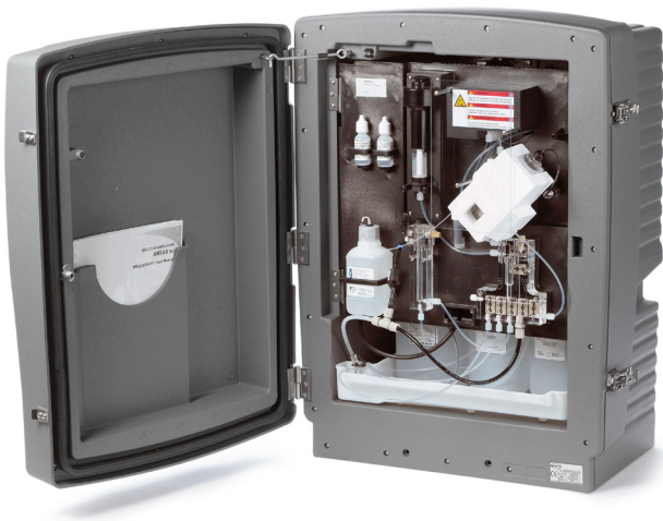
Figure 4: Hach Amtax sc Ammonium Analyzer