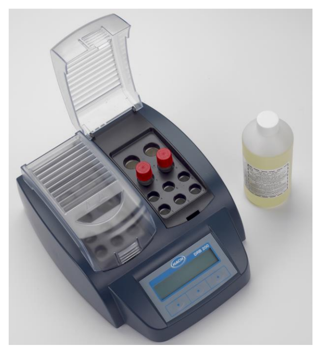
Figure 1: Combination reagent, sample/digestion vials, and digestion block

minimizing sample exposure, as does the use of a combined sampling-digestion vial. The sample is taken directly into the DRB200 digestion vial. FerroZine reagent is added. The vial is capped and digested. The digested sample is sipped or poured into the sample cell and read. With careful technique, a simple, inexpensive, and timely ULR total iron determination can be performed in the typical power plant laboratory.