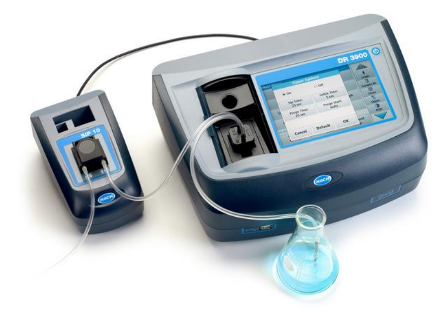
Figure 2: Sipper cell for improved sensitivity

minimizing sample exposure, as does the use of a combined sampling-digestion vial. The sample is taken directly into the DRB200 digestion vial. FerroZine reagent is added. The vial is capped and digested. The digested sample is sipped or poured into the sample cell and read. With careful technique, a simple, inexpensive, and timely ULR total iron determination can be performed in the typical power plant laboratory.