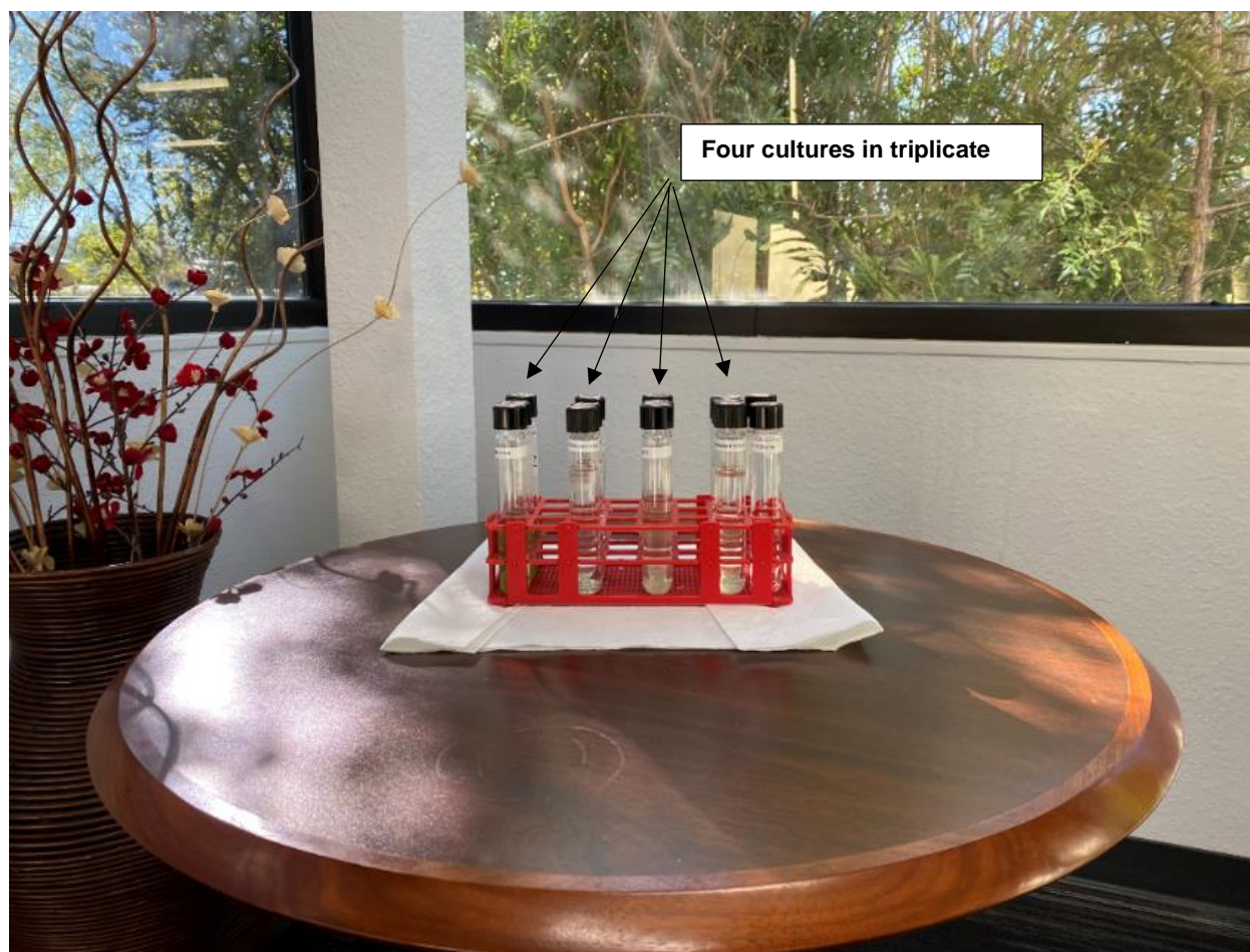
Figure 1. Four cultures with triplicate test tubes per culture and two blank test tubes

In November 2019, multiple algal cultures were diluted to within a concentration range of 0.08 – 0.26 µg/L chlorophyll content. One hundred and fifty milliliters of each culture were evenly distributed into three 25 mm diameter glass test tubes (50 milliliters per test tube per culture) and placed in a room temp environment near a window for exposure to natural light - see Figure 1.