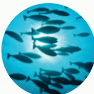
Sea water monitoring, fish farming, aquarium