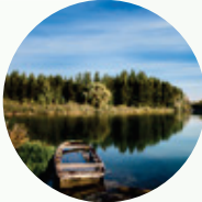
Surface water monitoring