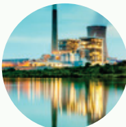
Industrial effluent treatment